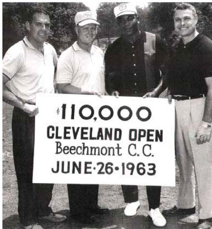
Celebrity Golf events have long been a part of the Browns rich tradition of giving back to the community through participation, as in this event held in 1963 featuring (from left to right): Otto Graham, Jack Nicklaus, Jim Brown and Dante Lavelli.

Last year over 30 Browns alumni participated in over 20 events which helped to raise almost one million dollars for local charities. If you enjoy golf and plan to be in the Cleveland Ohio area this summer please, feel free to contact us to get information regarding any upcoming events that might be available. If you know of a fellow alumni or celebrity that would like to be added to the list, please feel free to call or email us at (440) 824-6119 or tdick@clevelandbrowns.com